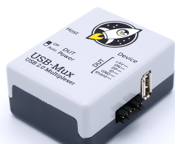
USB-Mux (DUT side)