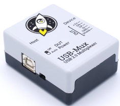
USB-Mux (Host side)